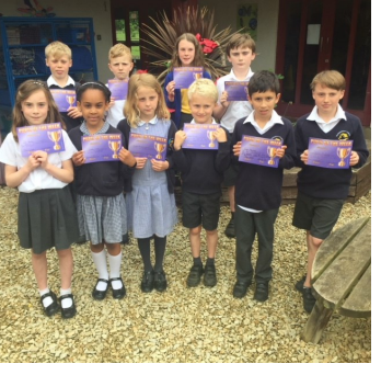
25th May 18