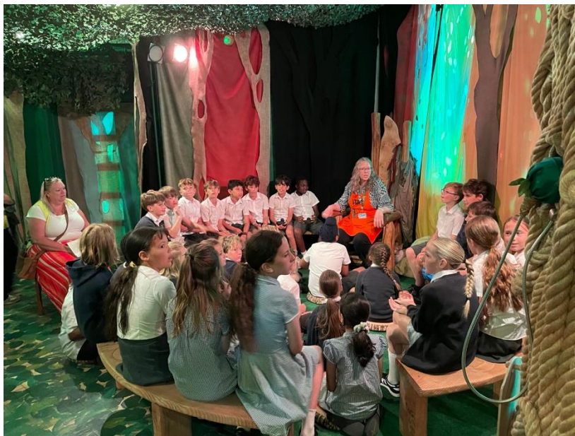
Above: The Oxford Story Museum (Yr 5)

Thank you for continuing to work in partnership with us to ensure our school remains a safe, welcoming, and respectful environment for all.